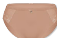
48358 | Slip / brief 38-48