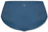
36089 | Panty / shorty 38-46

85% Polyamid / polyamide 15% Elasthan / elastane / élasthanne Cup Material / coupe le matériel: 90% Polyester 10% Elasthan / elastane / élasthanne