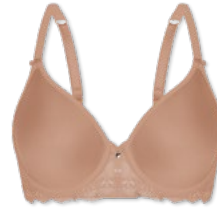
28358 | Spacer-BH / spacer bra / SG spacer B-E | 75-95 FLEXICUP Cup Material / coupe le matériel: 90% Polyester 10% Elasthan / elastane / élasthanne