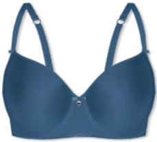
25790 | Spacer-BH / spacer bra / SG spacer B-E | 75-95 FLEXICUP

90% Polyamid / polyamide 10% Elasthan / elastane / élasthanne