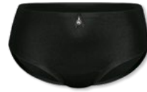
34457 | Panty / shorty 38-46