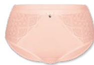
34453 | Panty / shorty 38-46