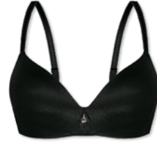
14457 | Soft-BH Einlage / padded soft cup bra / SG paddé sans armatures B-D | 75-95