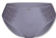
44349 | Slip / brief 38-48