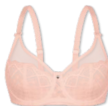
24454 | Bügel-BH / wire bra / SG avec armatures B-E | 75-95