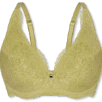
24425 | Bügel-BH / wire bra / SG avec armatures B-E | 75-95