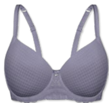
24349 | Schalen-BH / paddes bra / SG paddé B-D | 75-95