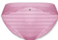
44455 | Slip / brief 38-48