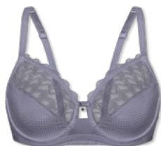
24350 | Bügel-BH / wire bra / SG avec armatures B-E | 75-95