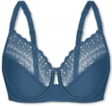
24790 | Bügel-BH / wire bra / SG avec armatures B-F | 75-100

90% Polyamid / polyamide 10% Elasthan / elastane / élasthanne