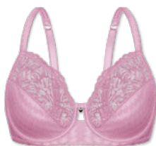
24456 | Bügel-BH / wire bra / SG avec armatures B-E | 75-95