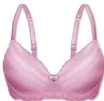
24455 | Schalen-BH / paddes bra / SG paddé B-D | 75-95