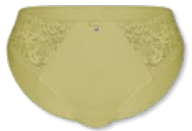
44424 | Slip / brief 38-48