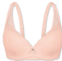
24453 | Schalen-BH / paddes bra / SG paddé B-D | 75-95