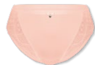
44453 | Slip / brief 38-48