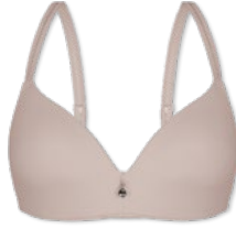
14457 | Soft-BH Einlage / padded soft cup bra / SG paddé sans armatures B-D | 75-95