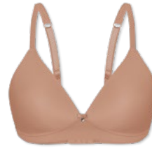
18358 | Soft-BH Einlage/ padded soft cup bra / SG paddé sans armatures B-D | 75-95