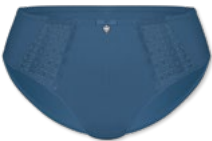
47889 | Slip / brief 38-48

92% Polyamid / polyamide 8% Elasthan / elastane / élasthanne