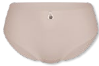
34457 | Panty / shorty 38-46