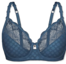
24427 | Bügel-BH / wire bra / SG avec armatures B-E | 75-95