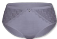
34349 | Panty / shorty 38-46