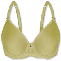
24424 | Spacer-BH / spacer bra / SG spacer B-E | 75-95 FLEXICUP Cup Material / coupe le matériel: 90% Polyester 10% Elasthan / elastane / élasthanne