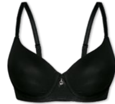
24457 | Schalen-BH / paddes bra / SG paddé B-E | 75-95