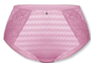
34455 | Panty / shorty 38-46