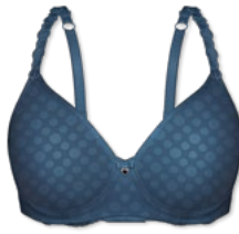
24426 | Spacer-BH / spacer bra / SG spacer B-E | 75-95 FLEXICUP Cup Material / coupe le matériel: 90% Polyester 10% Elasthan / elastane / élasthanne