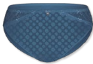
44426 | Slip / brief 38-48